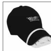
Cap Combo Add $ 1.50 per set for packaging. Includes Vantage stock band.