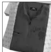
Standard Gift Box Add $ 2.50 per unit