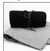
Rolled with Cord-inate Drawcord Add $ 2.00 per unit. Includes stock drawcord.